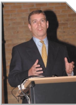
HRH the Duke of York encourages our members to make it happen at our 2002 Grand Launch.