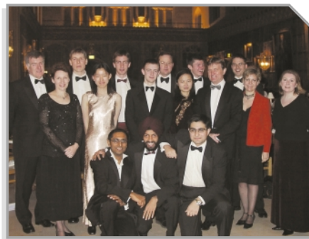
Our 2002 £50k qualifying dinner at Kings College.