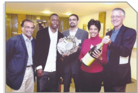
Enecsys (winners of the 2003 50k Competition) at our May 2003 prize giving ceremony.